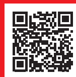
CL 639T with volumetric detection